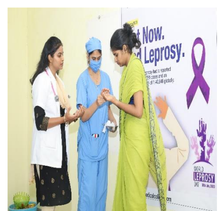
Three different cases of leprosy getting treatment for their disease condition