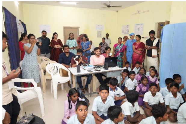
School students watching role play