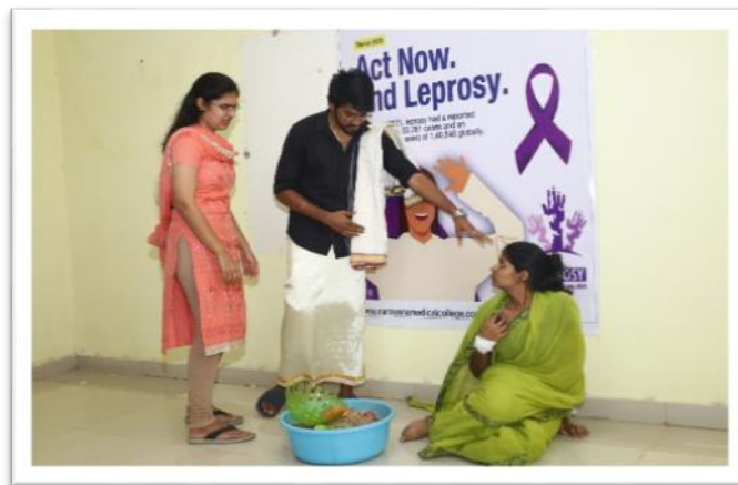
Vegetable vendor being thrashed by village headman