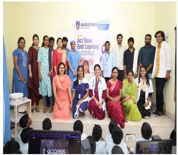
Dept Staff with participants of Role Play