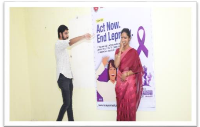
Worried school student showing his lesions to parents Husband sending his pregnant wife out of home